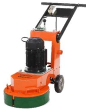
Fig.2: : Grinding or grit blasting machine