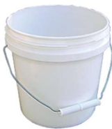
Fig.5: Empty bucket