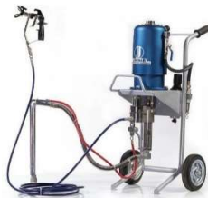
Fig.6: Airless spray machine