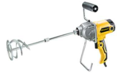
Fig.4: Mixing paddle fitted in a heavy-duty slow speed electric drill