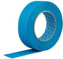
Fig.8: Masking tape